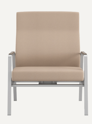
66517M30 30" wide motion chair