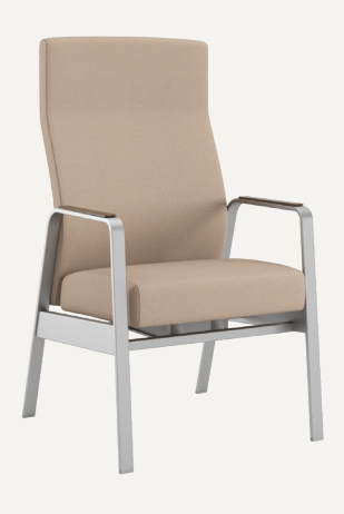
66517M21 motion chair