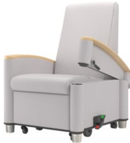
53W981 patient recliner, wide