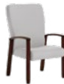
53471UB22 patient chair with urethane arm caps