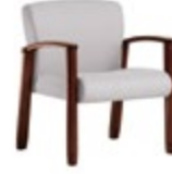
53471WB30 30" patient chair