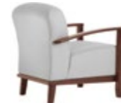
53L411W lounge chair