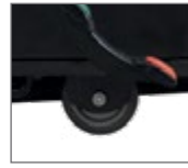
sealed quiet casters