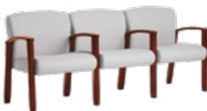
53410-TW 3-seat tandem