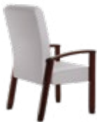
53471WB22 patient chair