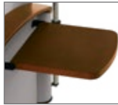
flip table half version shown