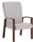
53471WB22 patient chair