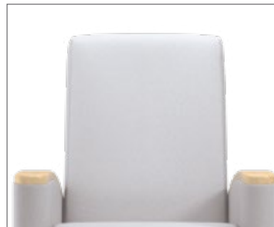
straight back available on all models with or without transfer arm option