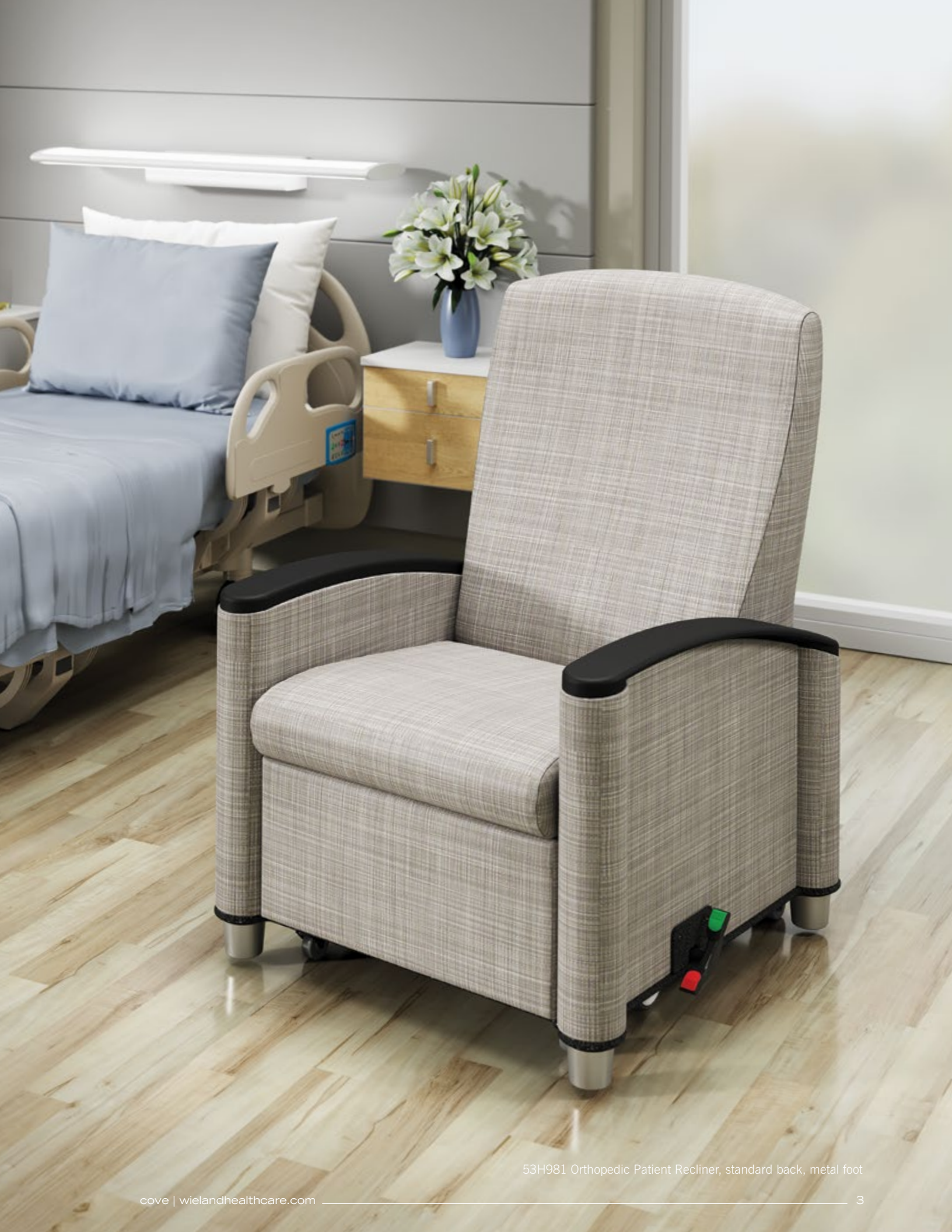
53H981 Orthopedic Patient Recliner, standard back, metal foot