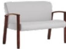
53411WB40 40" loveseat