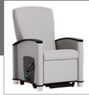
Orthopedic Higher seat minimizes effort to stand or sit down