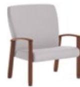
53471WB30 30" patient chair