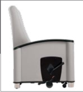
Patient Decades of proven dependability

Cove recliner provides precise movement with its unique Trac-Rite casters, zero turn radius and central brake system. Cove's effortless, one-handed steering during transport allows nurses to remain focused on patient care.