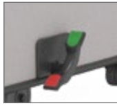
caster brake on both sides of chair