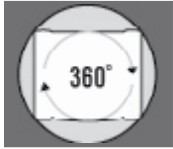
360° turning radius