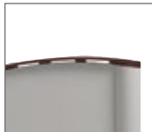
arm restraint cap