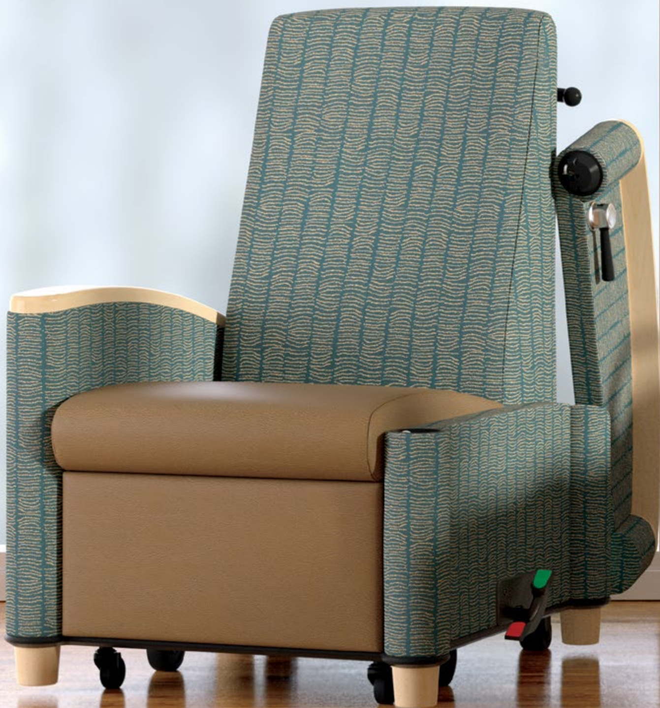
53981 Patient Recliner, straight back, transfer arm, pushbar, wood foot