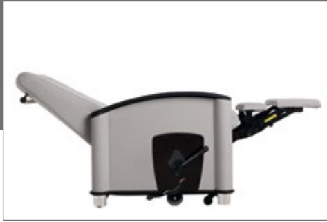
Sleep Designed for patient or overnight guest use