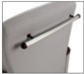
pushbar metal or wood