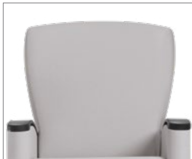
standard back not available with transfer arm option