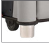
faux feet metal or wood