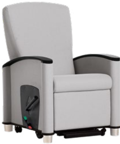
53H981 orthopedic recliner