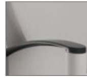
wood, urethane or solid surface arm caps