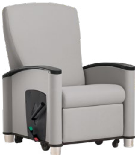
53W981 patient recliner, wide