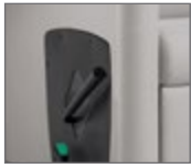
recessed ottoman handle