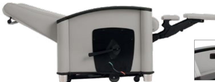
53981S sleep recliner